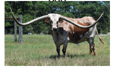
M ARROW CHA-CHING TAG 355