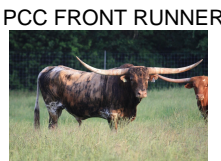
PCC FRONT RUNNER