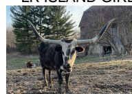
LR ISLAND GIRL