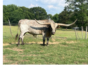
Heart Throb 44