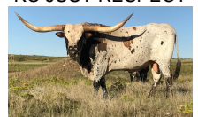
KC JUST RESPECT